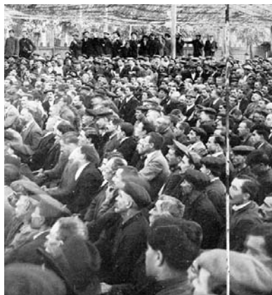
Workers Mass Meeting during the Tragic Week

In Spain, the “ Tragic Week ” began on Monday 26 July 1909 when the union, Solidarad Obrero , which was led by a committee of anarchists and socialists, called a general strike against the call-up of the mainly working class army reservists for the colonial war in Morocco. 17 By Tuesday, workers were in control of Barcelona, the “ fiery rose of anarchism ”, troop trains had been halted, trams overturned, communications cut and barricades erected. By Thursday, fighting broke out with government forces, and over 150 workers were killed in the street fighting.