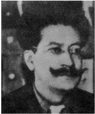
Ricardo Flores Magon: founder of the PLM

In Mexico, anarchists led Indian peasant risings such as the revolts of Chavez Lopez in 1869 and Francisco Zalacosta in the 1870s. Later manifestations of Mexican anarchism and anarcho-syndicalism, such as the Mexican Liberal Party (PLM), the revolutionary syndicalist “ House of the Workers of the World ” (COM) and the Mexican section of the Industrial Workers of the World (IWW), Mexican anarchism and revolutionary syndicalism continually challenged the political and economic dominance of the United States, and opposed racial discrimination against Mexican workers in foreign-owned enterprises, as well as within the United States. 33