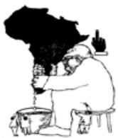
A South African Anarchist Pamphlet